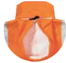
Tuck away hood.