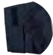
Adjustable sleeve cuff.