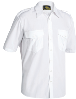
B16526 EPAULETTE SHIRT SS