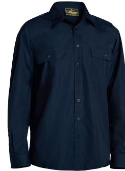
BS6526 PERMANENT PRESS SHIRT LS