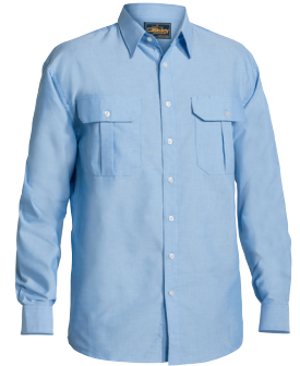
BS6030 OXFORD SHIRT LS