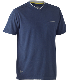
BK1933 FLX & MOVE™ COTTON V-NECK TEE SS