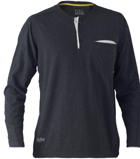
BK6932 FLX & MOVE™ COTTON HENLEY TEE LS