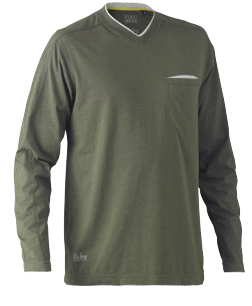
BK6933 FLX & MOVE™ COTTON V-NECK TEE LS