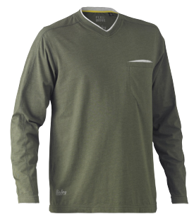
BK6933 FLX & MOVE™ COTTON V-NECK TEE LS