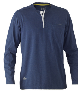
BK6932 FLX & MOVE™ COTTON HENLEY TEE LS