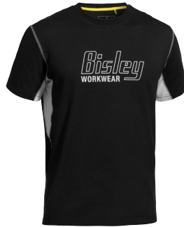
BK1922 FLX & MOVE™ CONTRAST TSHIRT SS