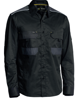
BS6133 FLX & MOVE™ MECHANICAL STRETCH SHIRT LS