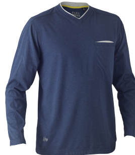
BK6933 FLX & MOVE™ COTTON V-NECK TEE LS