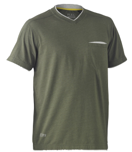
BK1933 FLX & MOVE™ COTTON V-NECK TEE SS