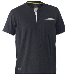
BK1932 FLX & MOVE™ COTTON HENLEY TEE SS