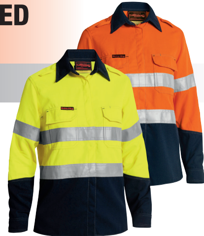
Yellow/Navy (TT01) Orange/Navy (TT02)