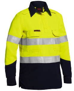
BLC8075T WOMENS TENCATE TECASAFE® PLUS 580 TAPED 2T HI VIS CLOSE FRONT FR SHIRT LS