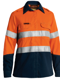
BL8098T WOMENS TENCATE TECASAFE® PLUS 580 TAPED 2T HI VIS LW FR VENTED SHIRT LS