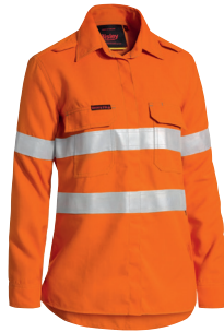
BL8097T WOMENS TENCATE TECASAFE® PLUS 580 TAPED HI VIS LW FR VENTED SHIRT LS