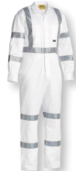
BS6807T 3M TAPED NIGHT DRILL COVERALL