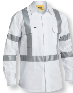
BS6807T 3M TAPED NIGHT DRILL SHIRT LS