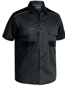
BS1133 FLX & MOVE™ MECHANICAL STRETCH SHIRT