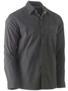
BS6146 FLX & MOVE™ STRETCH SHIRT