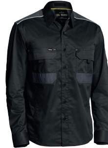
BS6133 FLX & MOVE™ MECHANICAL STRETCH SHIRT