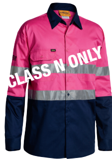
BS6896 _ TT32

3M TAPED 2T HI VIS COOL L/W SHIRT COMPLIES TO 4602.1:2011 CLASS N: NIGHT USE ONLY